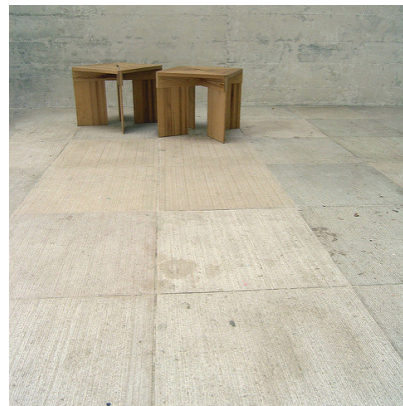
Photos: Carlo Scarpa - Olivetti Showroom Staircase, Venice, 1957-58 [top]